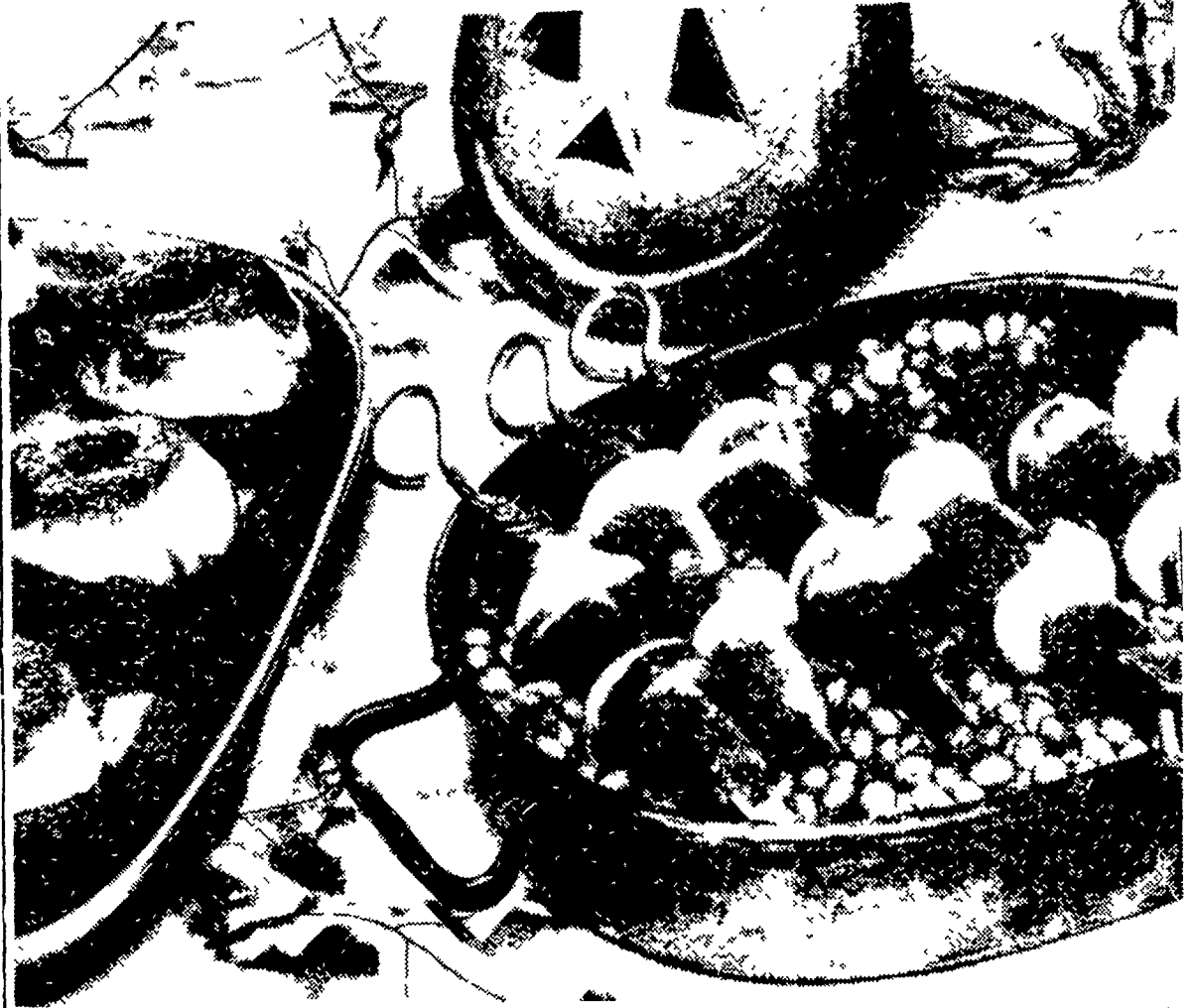
JACK O' LANTERN grins with satisfaction at this Halloween supper of Beans with Kabobs and Spicy Baked Apples. See recipes below.

Since we always think of pumpkin pie when we think of Hallow-