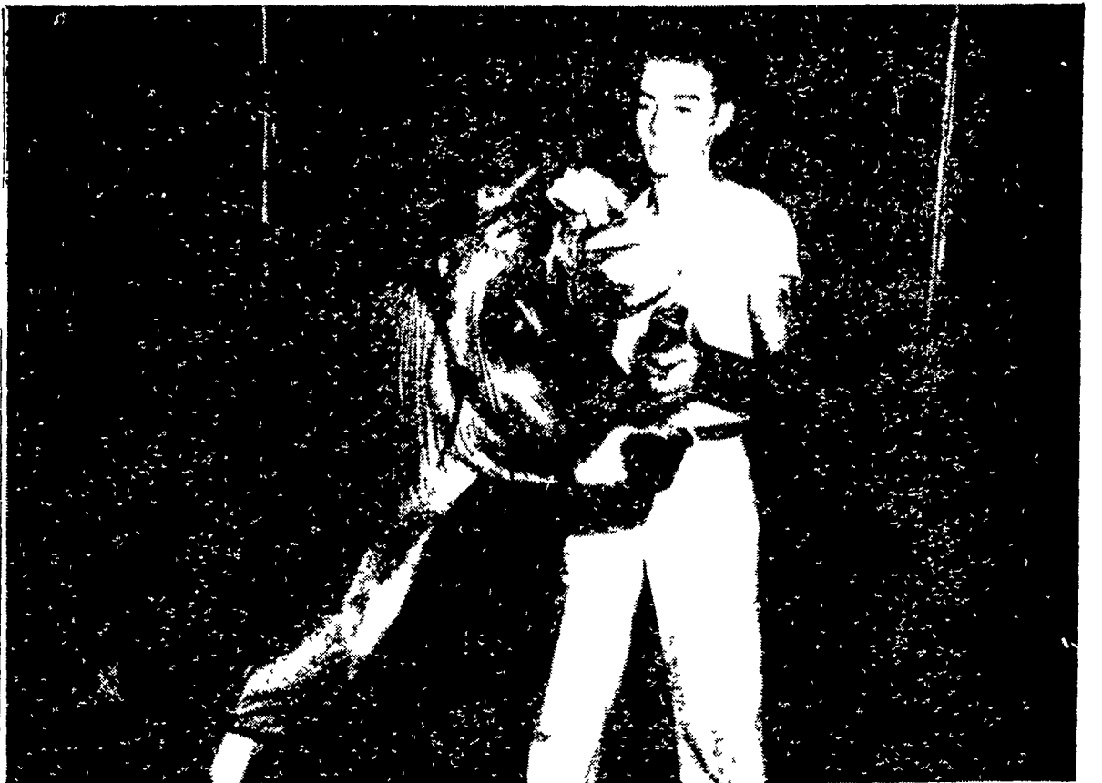
GRAND CHAMPION FFA Jersey at the 3rd annual Pennsylvania Junior Dairy Show

Since inbreeding and linecross- ing effects on performance in swine seem to be exact opposites,