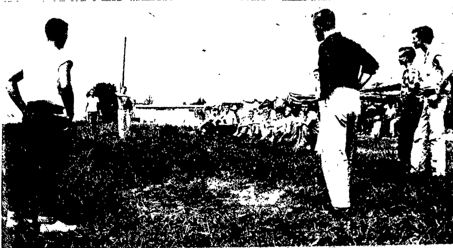
MEMBERS OF Lancaster County FFA chapters paused in the activities at Lampeter's Community fair for an old-fashioned horse-shoe pitching match behind the exhibit