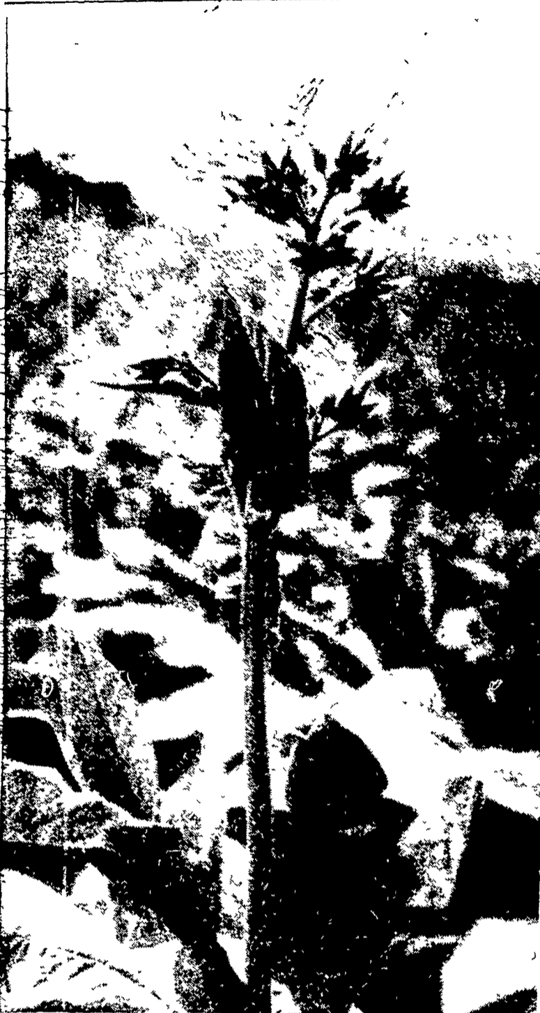
TOBACCO THIS YEAR looks extremely good and many fields that were planted early are showing bloom. A 100 mile tour of the County Monday showed that conditions are generally good with little variation in the quality of the crop.