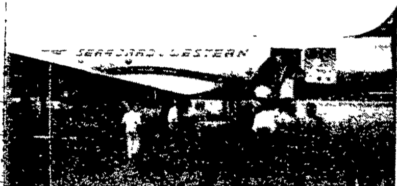
ABOVE. THE CALF shipment to Turkey is shown as the animals awaited inspection by the Bureau of Animal Industry. Below you see the plane being readied to transport the calves from the United States to Turkey.

The 27 head of cattle from Pennsylvania were purchased at a total price of $14,080 or an average of $521 a head.