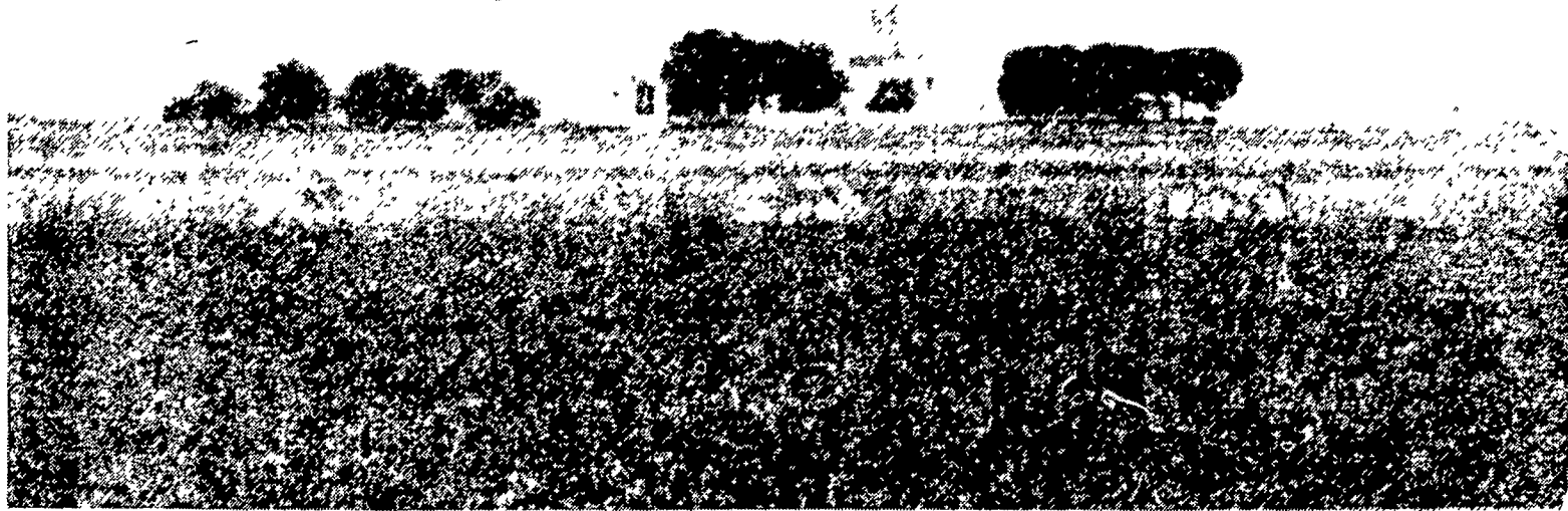
ALFALFA, AS YOU SEE in the foreground, is about ready for a second cutting in Lancaster County. Some farmers have started binding and shocking wheat although combining will not start for a few more days. The small grain crop appears to be exceptionally good this year and barley yields are reported high

FLORIN FARMS, INC. Mr. Joy 2 - Lancaster County - Pa. Phone Mt. Joy, O.L.dfield 3-9891