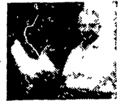
Monroe C. Babcock

Keep The Eggs From Your Various Flocks Separate