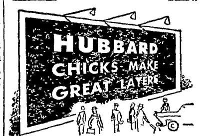
Hubbard Farms chicks will make more money for you. They become great layers.

The reassessment program is not designed to change the tax structure of the county, but rather to equalize the taxes throughout the county. When all the appraisals are made, the county commissioners will adjust the millage rate on the basis of the new appraised evaluation of the county.