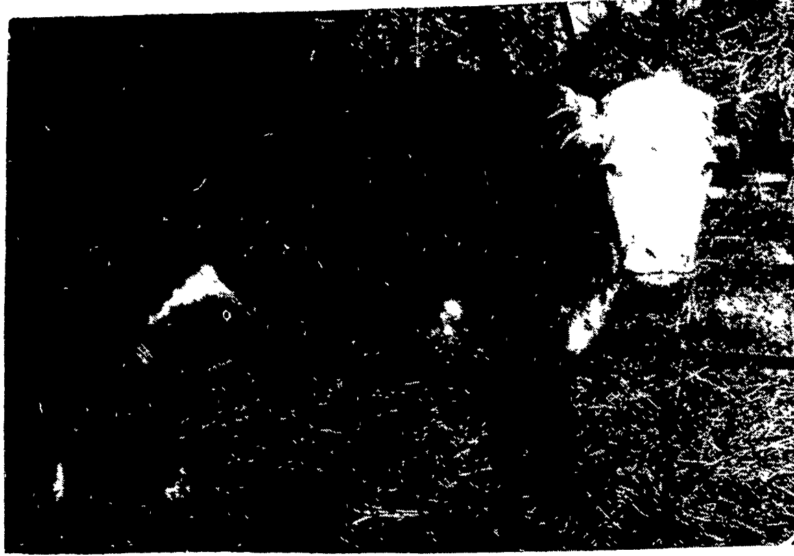
STEERS IN THE GOOD grade tend to lack growth, have longer heads and are a little shallow throughout. Fleshing is moderately thick, somewhat deficient in proportionate uniformity and may be slightly soft.

137 E. KING ST. Open daily 8:30 to 5:30 Friday until 9:00