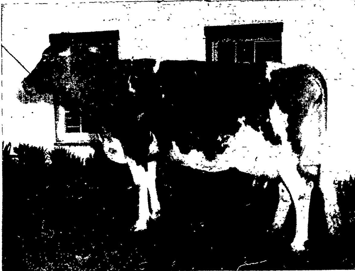
A NEW RECORD placing tenth in milk and fat production among the 10 highest of the Guernsey breed in her class has just been completed by Mulberry Hill Margrie E, a senior two-year-old owned by