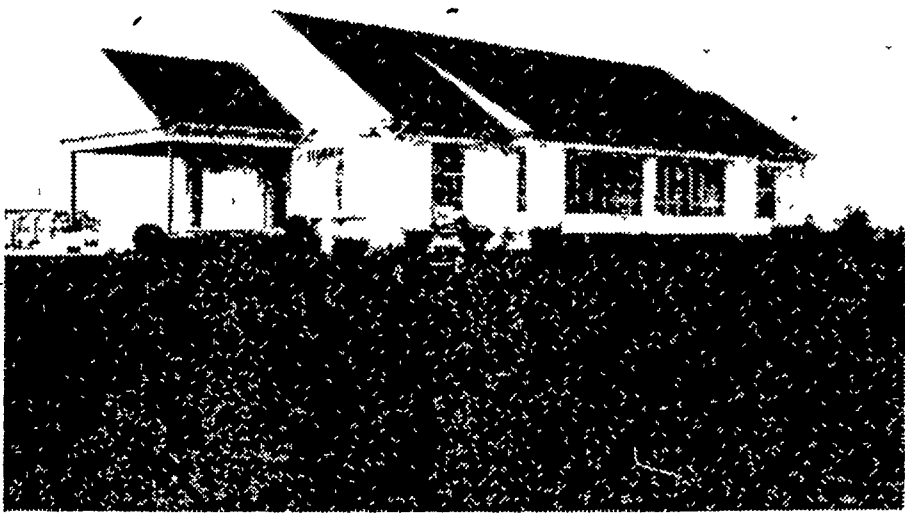
Pictured above is the new Farm Credit Office located on West Roseville Rd. between Rt 230 By-Pass and the Manheim Pike.