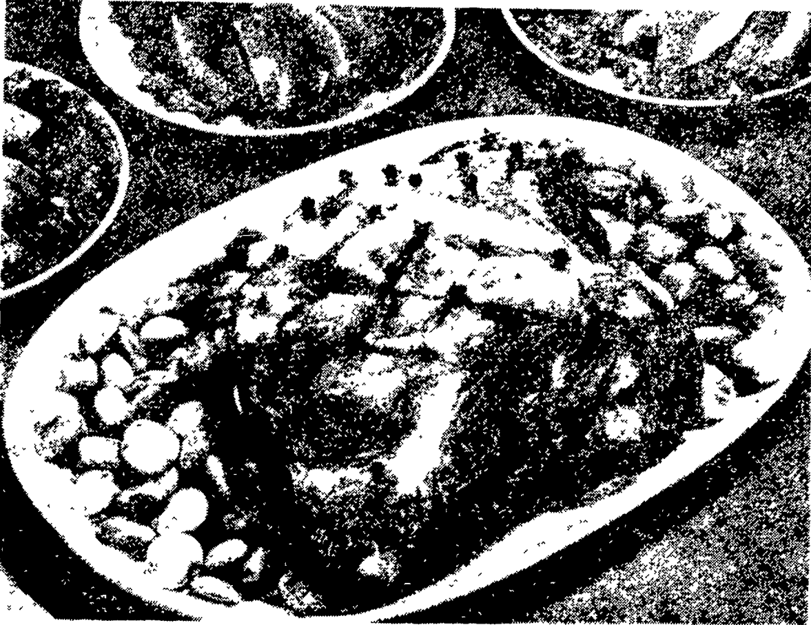
PICKLED PORK Roast with lima beans is a real man's meal. For the rest of the menu, serve a citrus fruit salad or a hearty green vegetable salad. Pork, as now be-

ing produced by modern farmers, is less fatty and more nourishing. And it rates high as a source of valuable nutrients for your family.