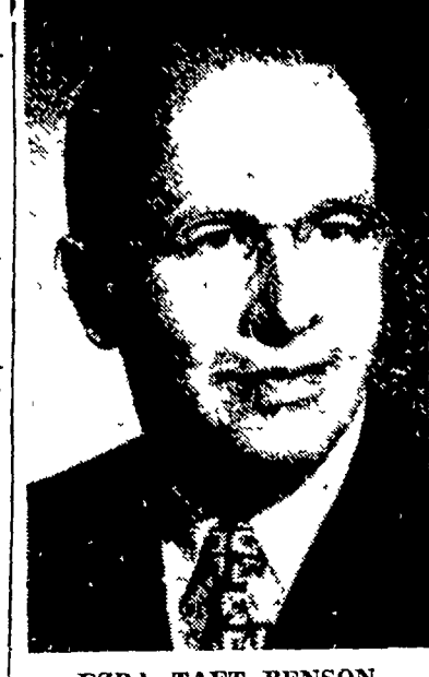
EZRA TAFT BENSON