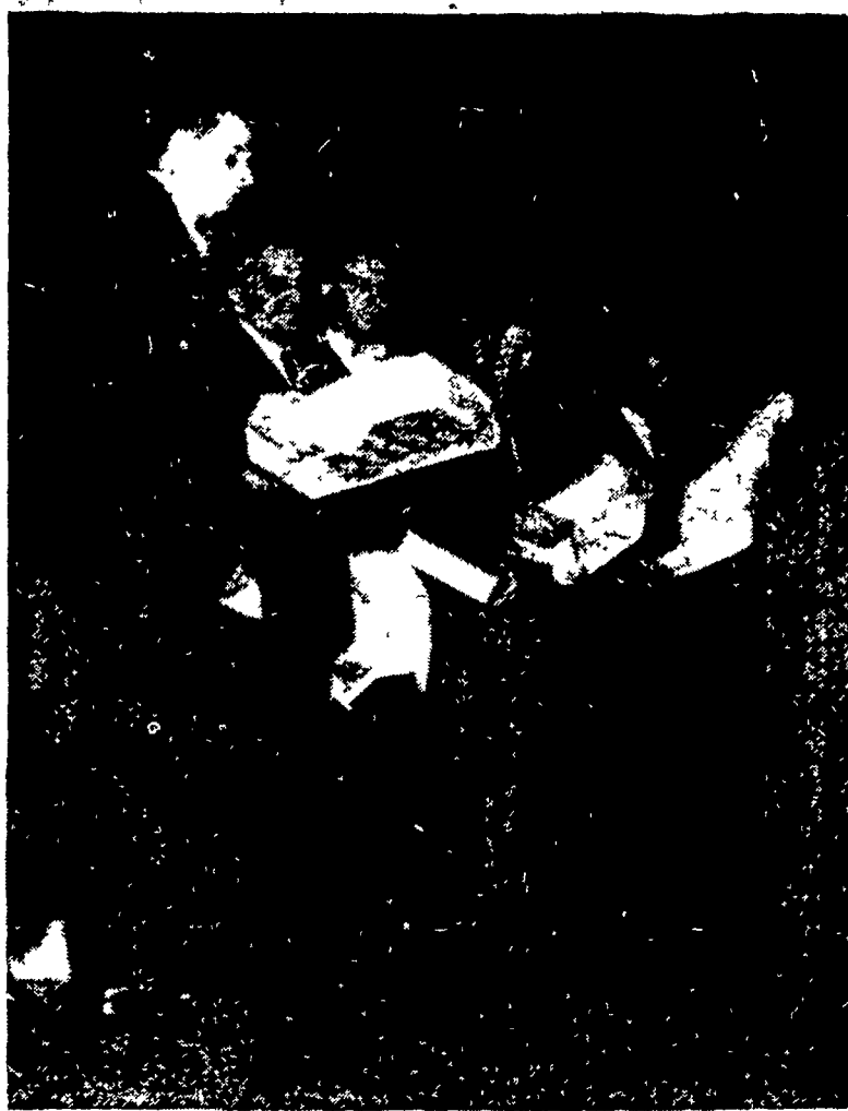
RED ROSE BABY beef and lamb club leader, too, received awards at the annual banquet. Each was given a western style shirt by the members. Nearly 500 people attended the banquet despite snow and freezing weather. ornp i honor R-f CM WFYTEA SRD ETA SHR SH ET ET