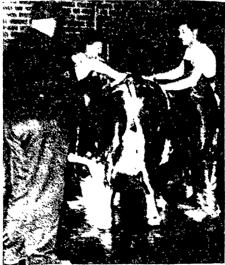
A TYPICAL SCENE at the Farm Show is found in the cattle washing sheds. Here the fine livestock are given a final bath and shampoo before going into the show ring. More than 2,000 head of livestock are entered in the 1958 Farm Show.