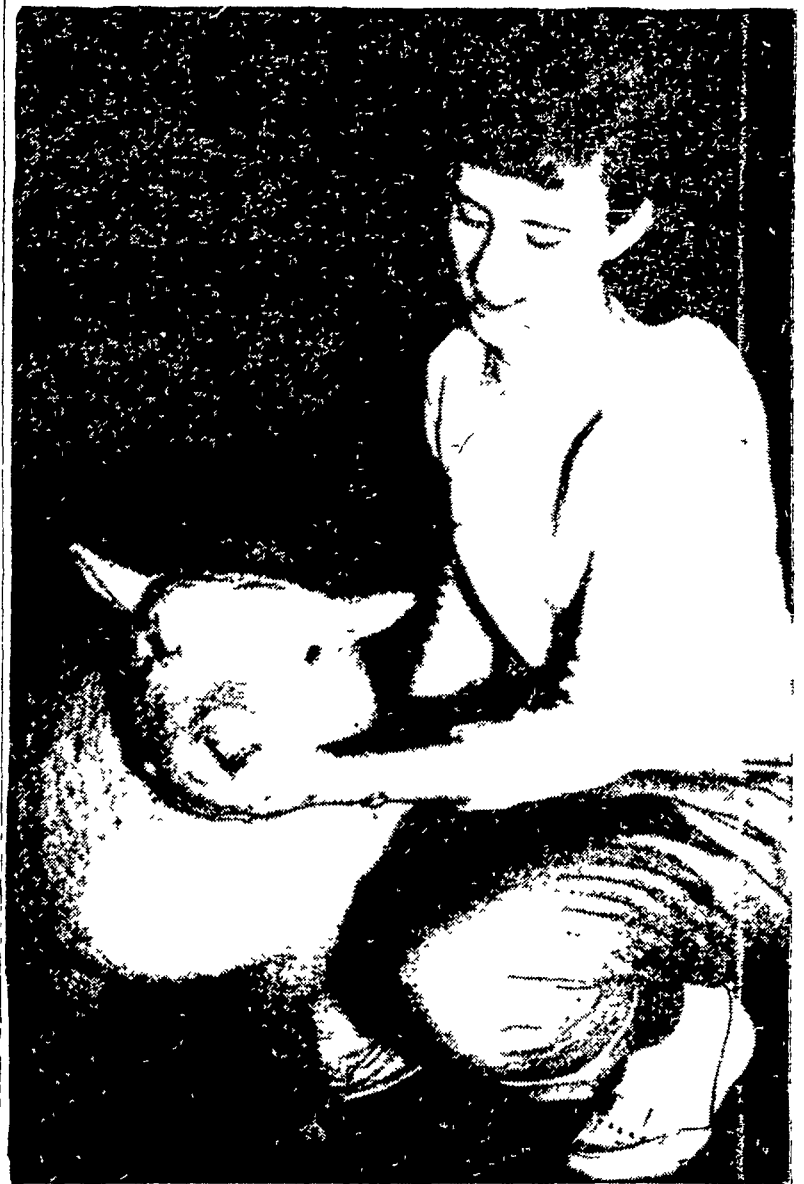
MISS NANCY GIBBLE, R3 Elizabethtown, had the reserve champion pen of Southdown lambs at the 1957 Farm Show. She is shown here with one of the three Miss Mary Keene, R1 Christiana, had the top pen of Southdowns and topped the 4-H Lamb sale

Approximately 90 per cent of the farm machinery exhibits had some or all of their display (Continued on page 11)