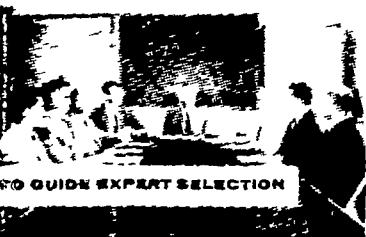
TO GUIDE EXPERT SELECTION

Data on the test birds is recorded on punched cards for most efficient use. Records on each bird cover some 15 traits of importance to profitable performance such as rate of lay, livability, egg size, height of firm albumen, number and size of blood spots.