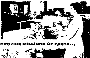
PROVIDE MILLIONS OF FACTS. . .

To assure effective selection for efficient performance under field conditions, many of the Kimber Leghorns under test have been placed on commercial farms for exposure to different forms of management, climate, feeding, housing and disease