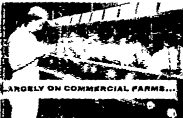
LARGELY ON COMMERCIAL FARMS. . .

Records are currently being compiled on over 50,000 birds, of which over 20,000 are individually pedigreed males and females housed above at Niles, California