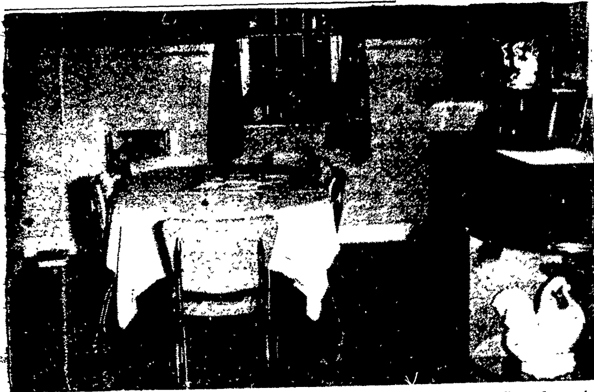
USE OF KNOTTY PINE in this remodeled kitchen kept the room in style with the 130 year old house it is in. The cabinets - See story on page 8.

at the right cover an old fire place. An electric stove and refrigerator complete the kitchen equipment.