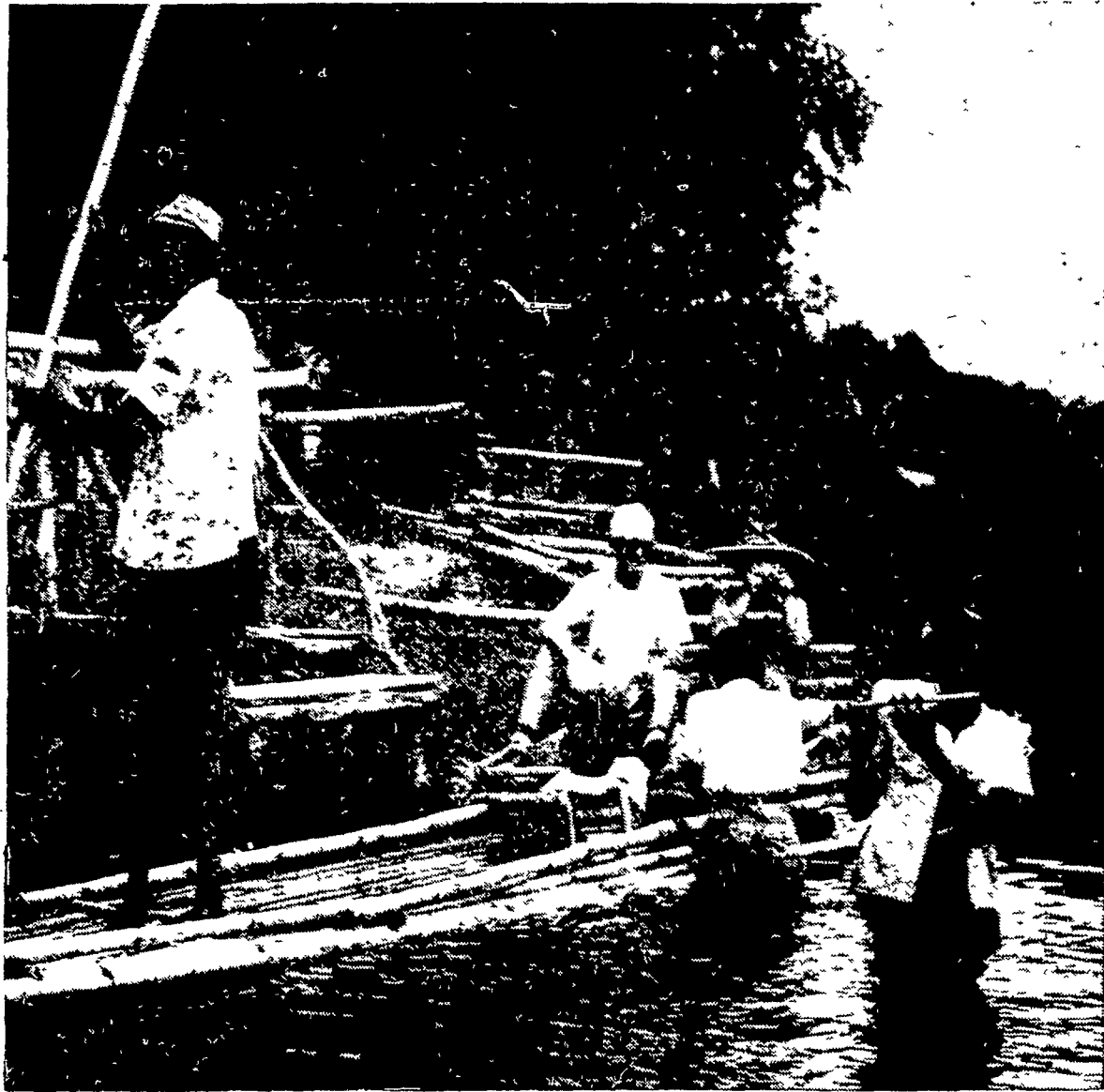
SMALL BOYS WITH bamboo flutes entertain a rafting party about to set out on an exciting, scenic three-hour trip down the rapids of the Rio Grande in northern Jamaica. The raft, according to the author, is held together by baling wire and instinct