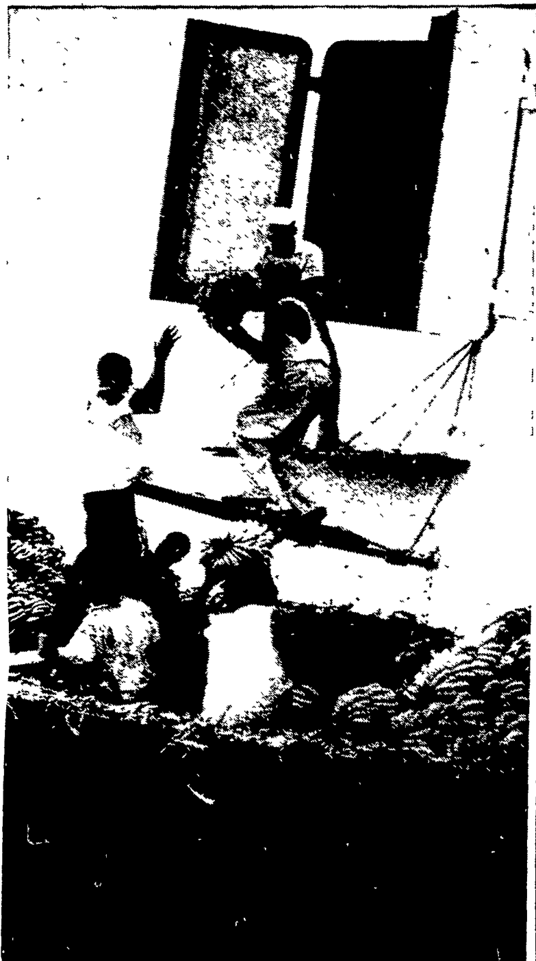
JAMAICA BANANAS start their ripening process enroute to consumers in the United States and other lands. Here boatmen load a refrigerated ship at one of the island's many banana ports. In some areas, lighters such as these carry the green bunches to ships anchored off-shore in deeper waters