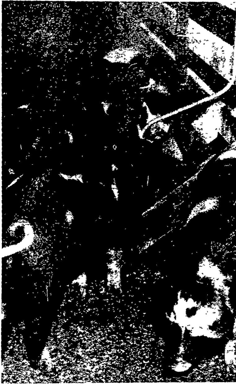
WATER IN LARGE QUANTITIES is necessary for efficient pork production. Authorities say that 53 per cent of the weight of a market hog is made up of water. Therefore plenty of watering facilities are provided in these new houses. The pipe running down is an electric conduit to a heater.

An ordinary two-inch paint brush is handy for dusting book-tops, carvings, window sills and the like.