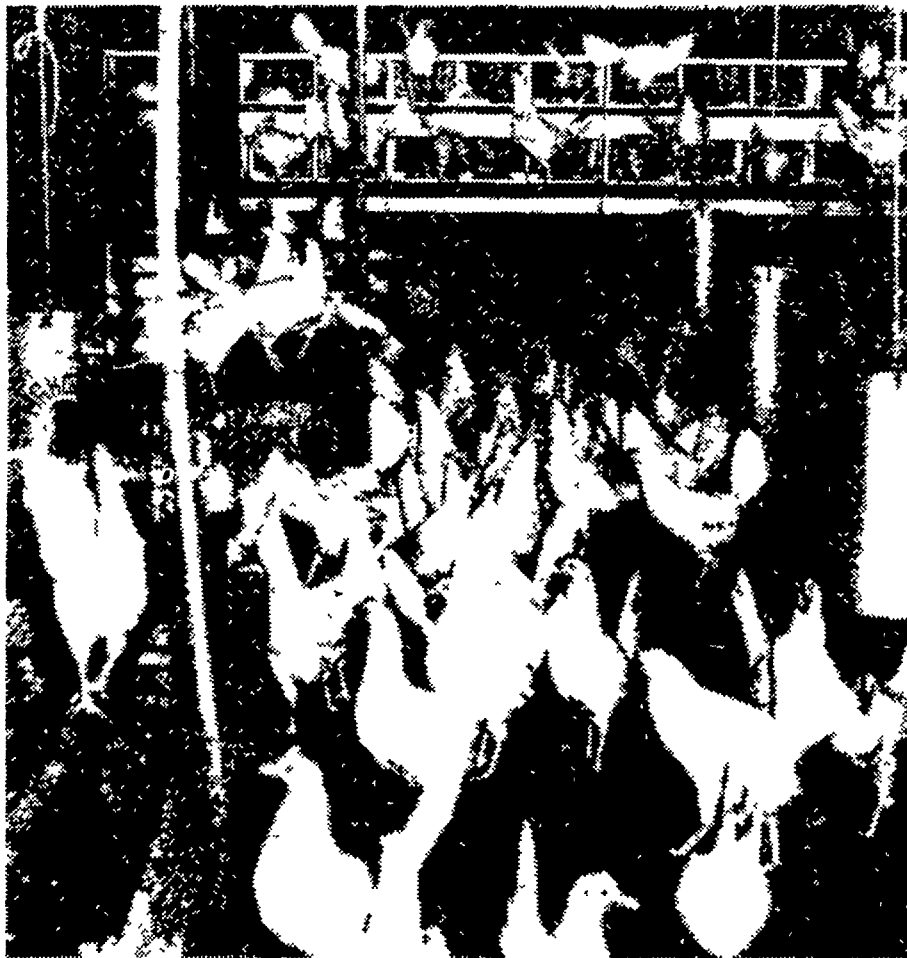
2,500 hens on the John L. Stoltzfus Farm, Bareville, Pa., averaged laying 23.4 eggs per bird during latest 30-day reported period on new SUPER Ful-O-Pep Laying Ration. That's super performance! The results of new SUPER Ful-O-Pep.