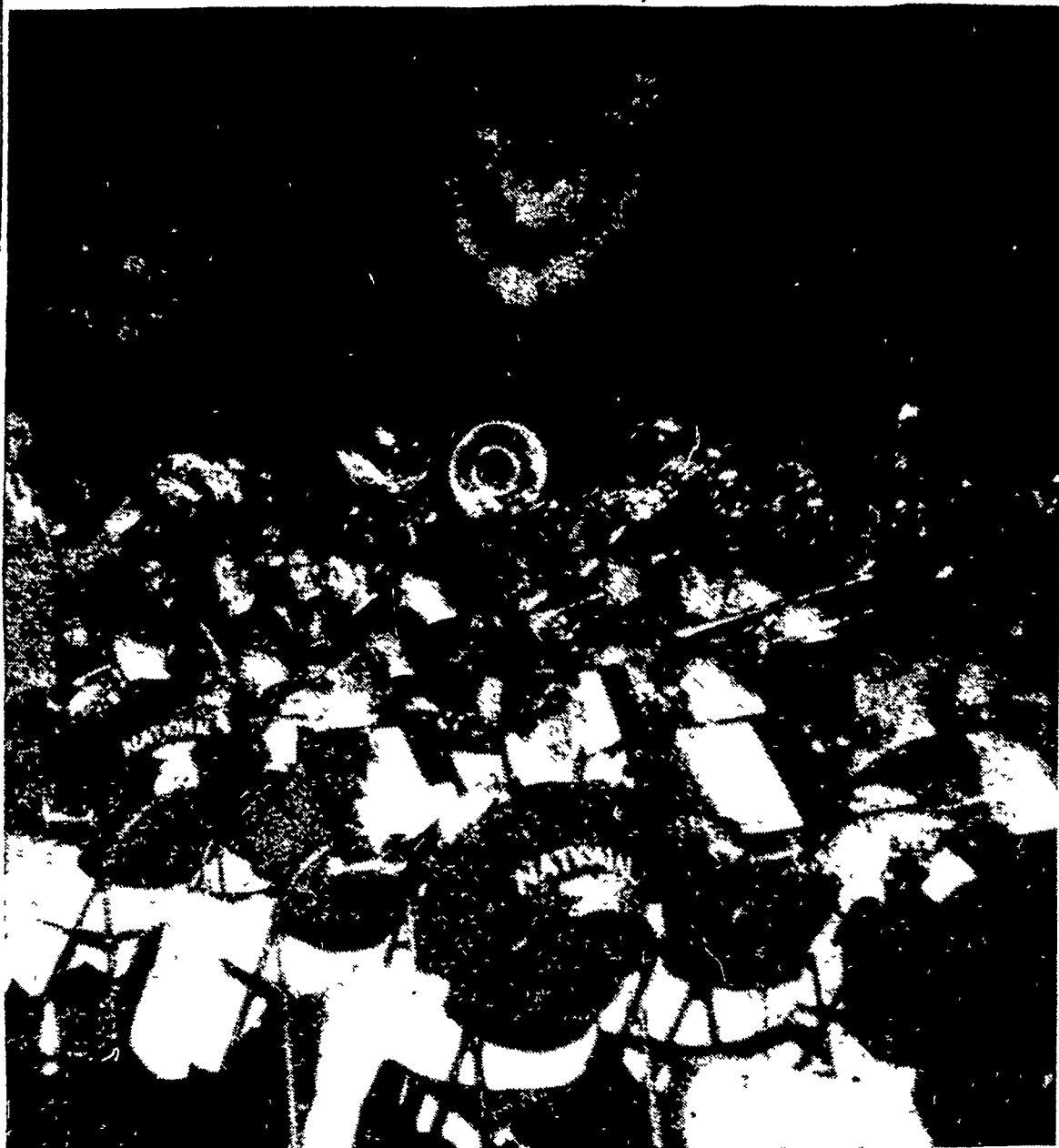
THIS IS THE NATIONAL FFA band representing 41 states. The band performed daily at the National FFA Convention sessions, the American Royal Ball, and at the Saddle and Sirloin Club.

The secretary will address the FAO conference on Nov. 7. He had planned to attend both in 1956 and in 1955, but was unable to go to Italy at the times of the meetings.