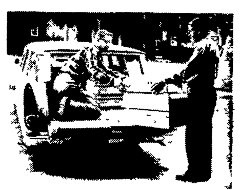
Rapid gentle delivery of your Babcock Bessies. This photograph shows Bruce Babcock and Russell Mease loading Babcock Bessies for a customer. Chicks are gently handled and kept at just the right temperature at all times. A quick delivery to your farm helps to give you nice uniform chicks.