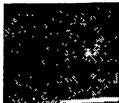
1. Start litter on new, improved Purina Baby Pig Chow. Then creep feed Purina Pig Startena until 3 weeks after weaning.