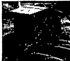
2. Put pigs on growing ration of 4 parts grain and 1 part Purina Hog Chow until pigs are about 3 months old.