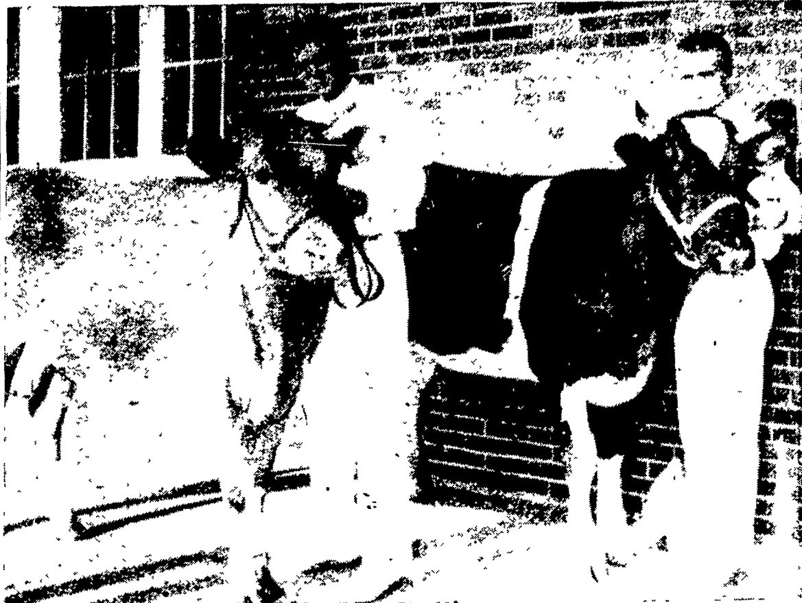
THE PRESIDENT AND VICE PRESIDENT of the Donegal FFA Chapter were exhibitors at the State Junior Dairy Show held Thursday in Harrisburg. Winning Reserve Champion with his Guernsey