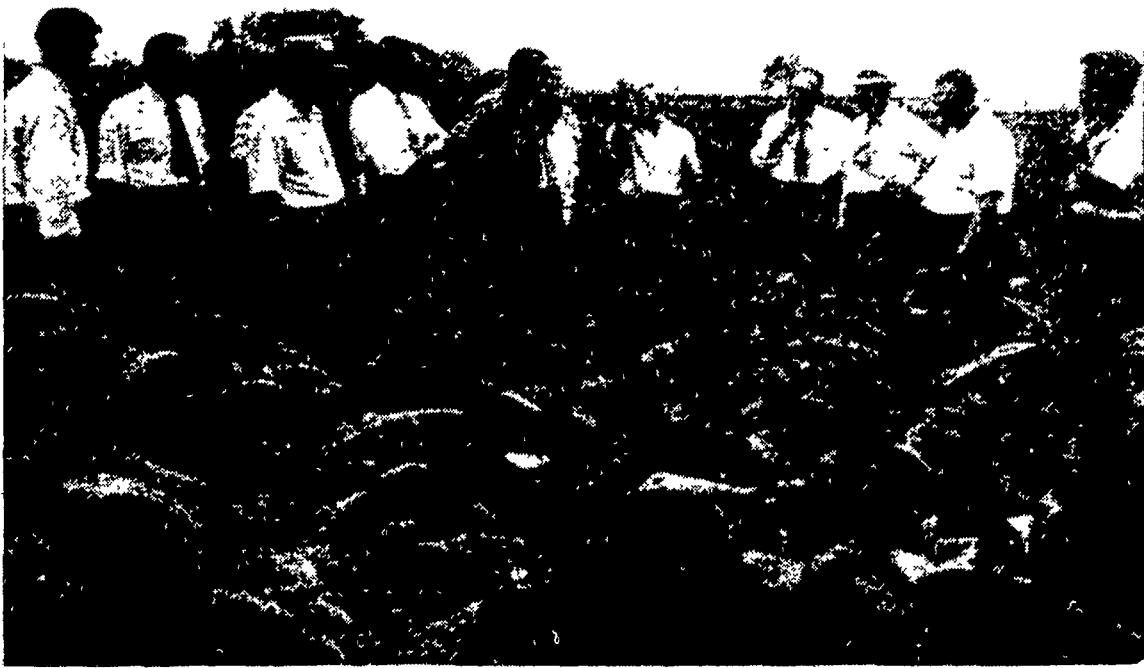
THE AGRICULTURAL COUNCIL of Lancaster County met Thursday at the Southeast Pennsylvania Research Station near Landisville. Workers at the station said that their breeding and evaluation program in tobacco was slowed up considerably this year by the drouth. They did feel, however, that they are making progress in sucker control work and in breeding and development of new varieties

Vermont is the fourth State to achieve brucellosis-free status this year and the ninth in the U.S. to have such status, the other States being Connecticut, Delaware, Maine, Minnesota, New Hampshire, North Carolina, Washington, and Wisconsin.