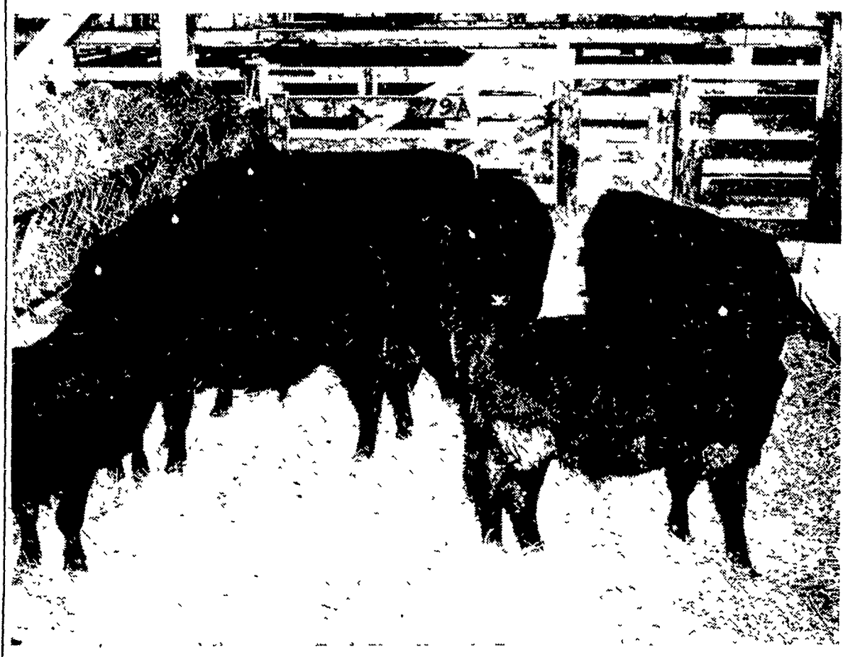
Visit the Steer Feeding Demonstration at the Stock Yards, Lancaster.