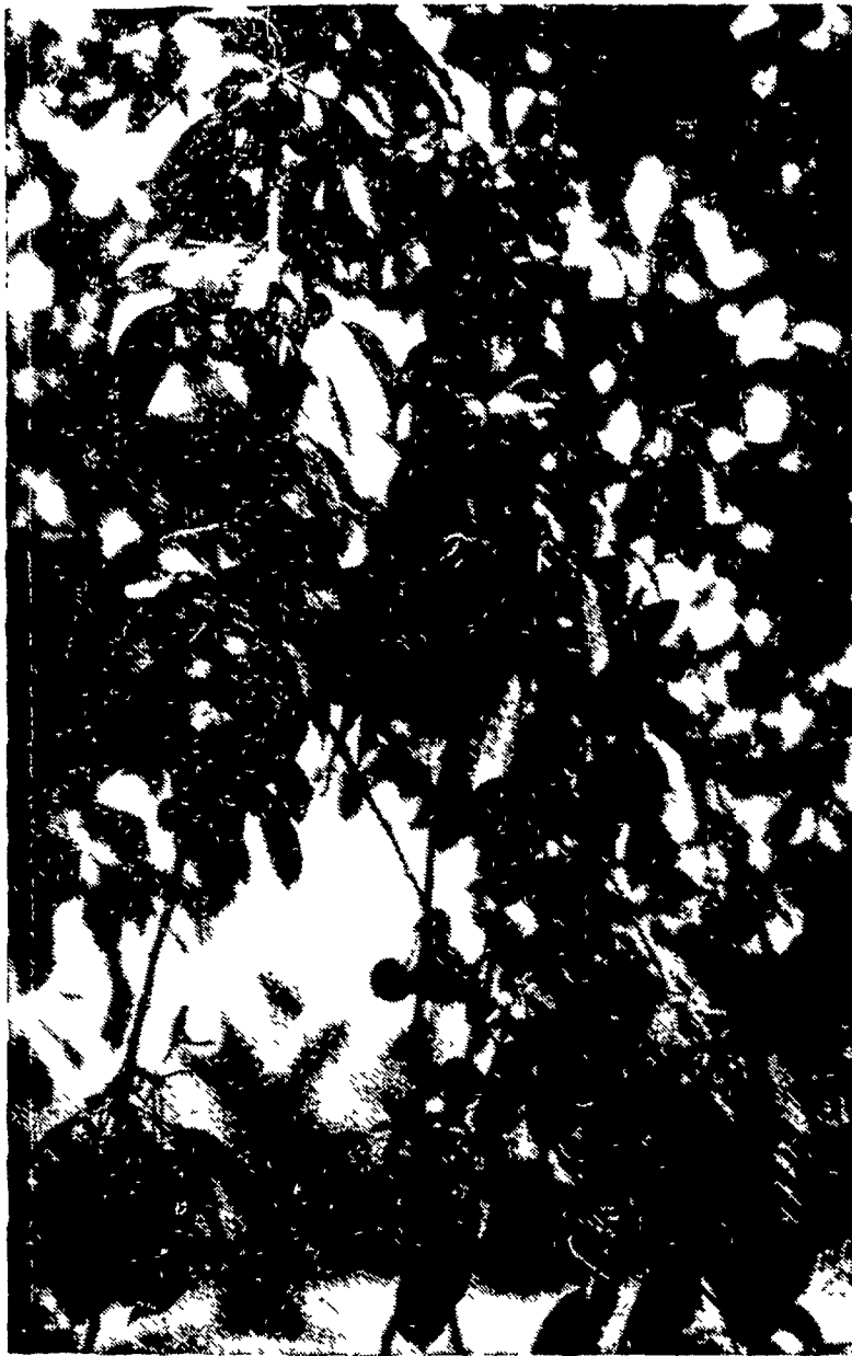
CHERRIES ARE RIPENING and harvest of the red fruit should be hitting its stride by the middle of next week. The State Department of Agriculture reports that yields are expected to be 50 per cent greater than last year. These cherries are in the orchards of Masonic Homes, Elizabethtown.