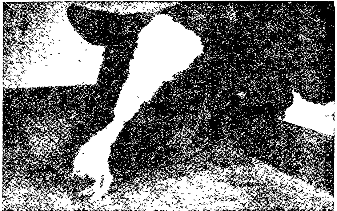
when watery spring pastures make fussy eaters...

Homemakers register for the entire three-day program and start their classroom work at 9 a m, June 18. They leave the campus Thursday, June 20, after breakfast.