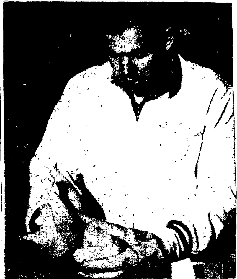
ONE OF THE FIRST PLACE broilers from the regional Chicken of Tomorrow contest held Monday at Coatesville is packed to be sent to Harrisburg for the state contest. The annual contest for young people is designed to help create interest in producing a better meat type bird.

The contest is sponsored by the Pennsylvania Poultry Federation.