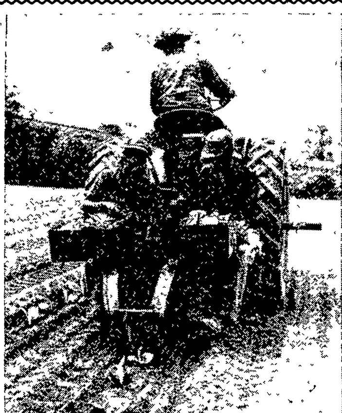
SEE THE GENUINE