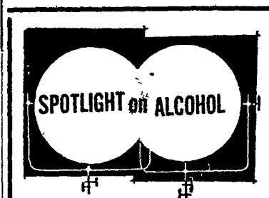
WHO'S THE CHICKEN?

And Christmas trees are a crop. They take about 10 years to mature, but they are a crop in every