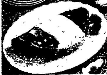
OMELET WITH ZESTY CHEESE SAUCE