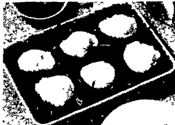
POACHED ON FLAVORFUL CORNED BEEF HASH