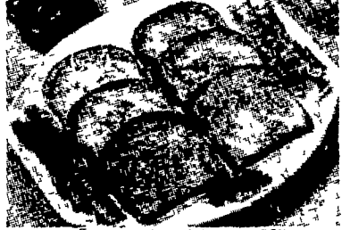
FRENCH TOAST WITH CRISP BACON

POULTRY AND EGG NATIONAL BOARD (Egg Division) Executive Offices and Home Economics Kitchens: St. Charles, Ill. Regional Offices: NEW YORK, BOSTON, S. N. FRANCISCO, ATLANTA