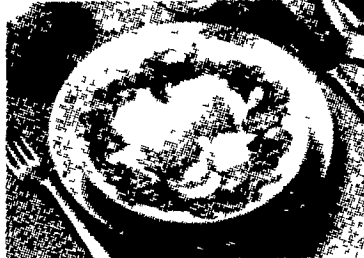
SOFT COOKED WITH CHOICE OF CEREALS