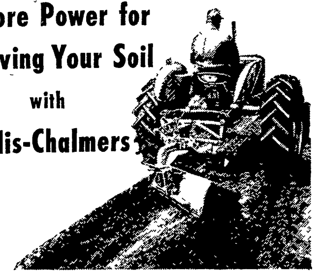
Blade reverses, leans forward or back for penetration.

Soil conservation . . . better use of soil and water . . . means more money in your pocket . . . more value in your land. Build your own terraces, dams, waterways . . . and do your own subsoiling . . . with your own convenient Allis-Chalmers equipment.