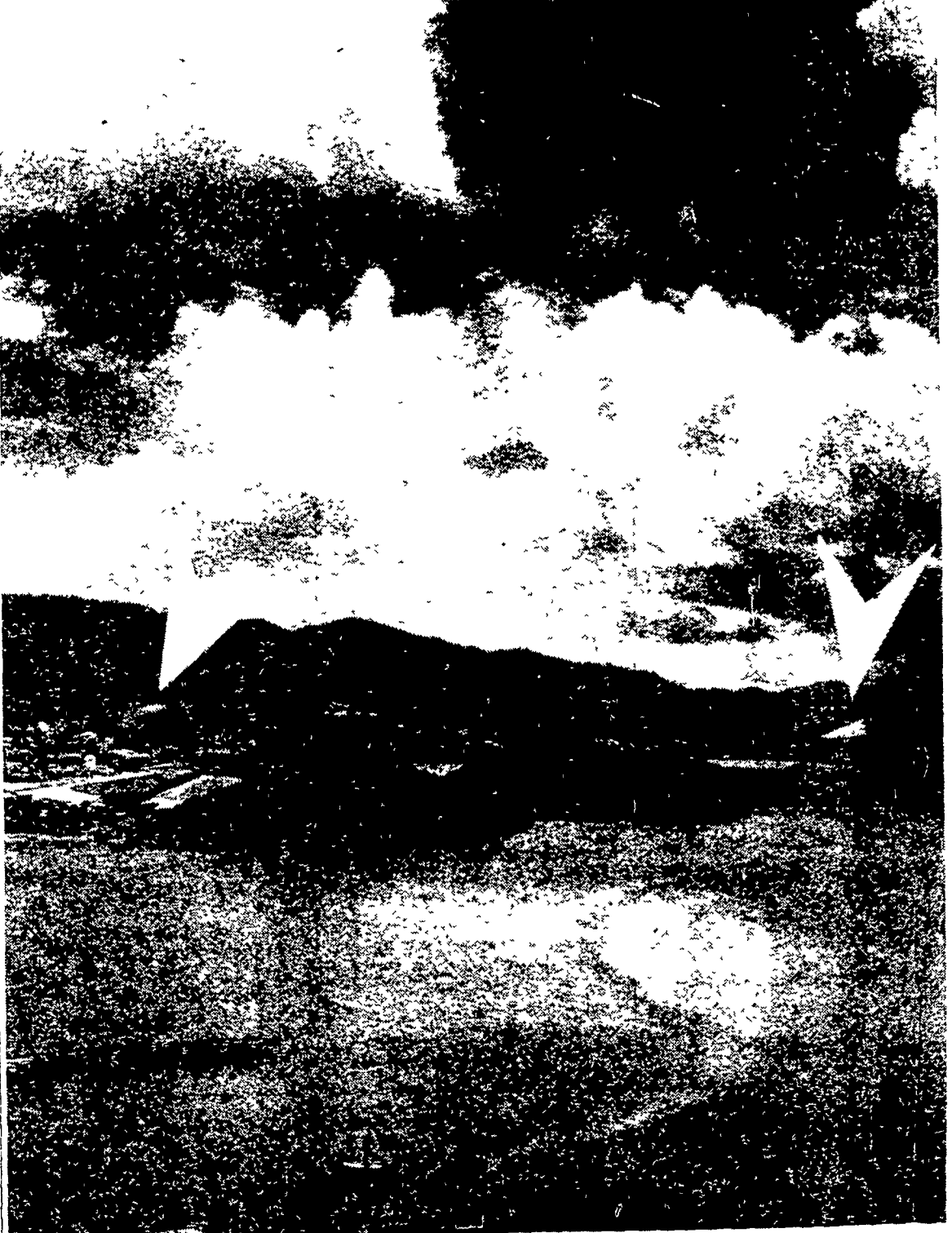
WATER CATCHMENTS that supply residents of St. Thomas in the Virgin Islands with drinking water are shown in. There are several just above the city (left), as well as another shown by the bright patch on the left.