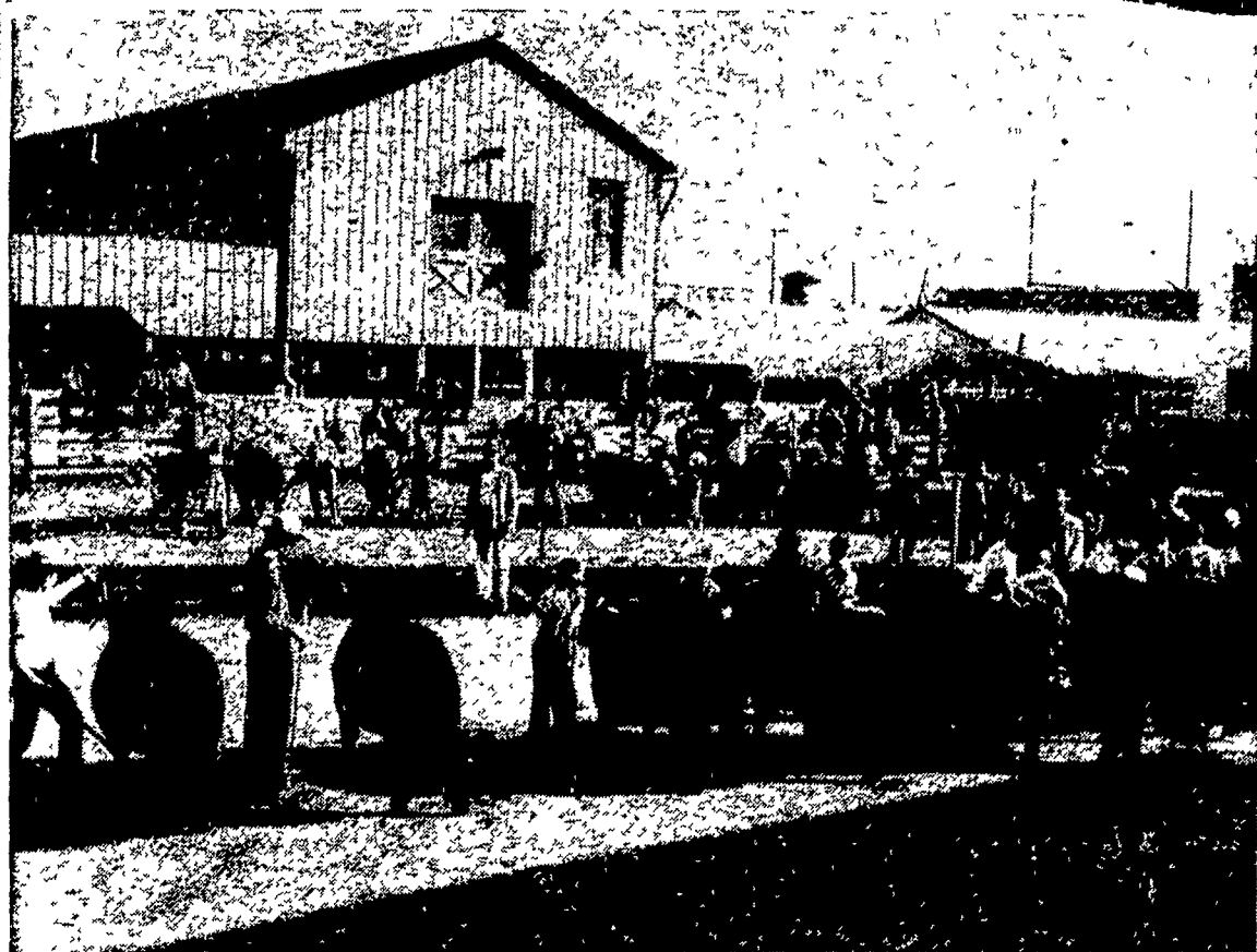
TWENTY-FOUR TOP steers were selected Tuesday at Union Stock Yards, Lancaster, to be shown as Lancaster County entries in the 1957 State Farm Show at Harrisburg. Here is a general view of the event.