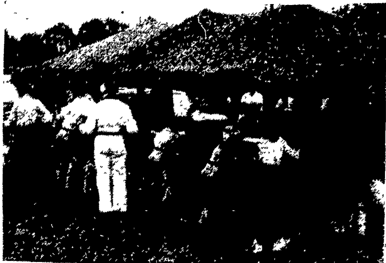
Steers are lined up for judging at the Southern Lancaster County Community Fair in Quarryville Wednesday afternoon, as the fair season gets underway in the Garden Spot. (Lancaster Farming Staff Photo).