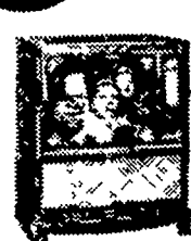
21-in. Black and White Television Set