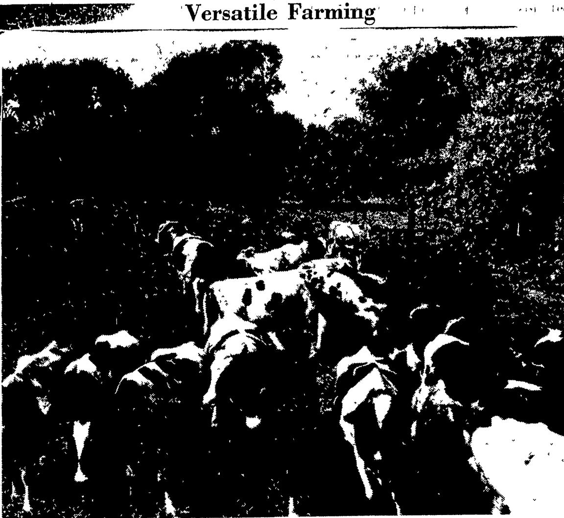
Versatile is the pattern of farming at Nolt's Ponds, where a herd of dairy stock is maintained in addition to tobacco, corn and small grains — plus aquatic plants and fish.

Let rise again, about double, bake in 350-degree oven about 30 or 35 minutes.