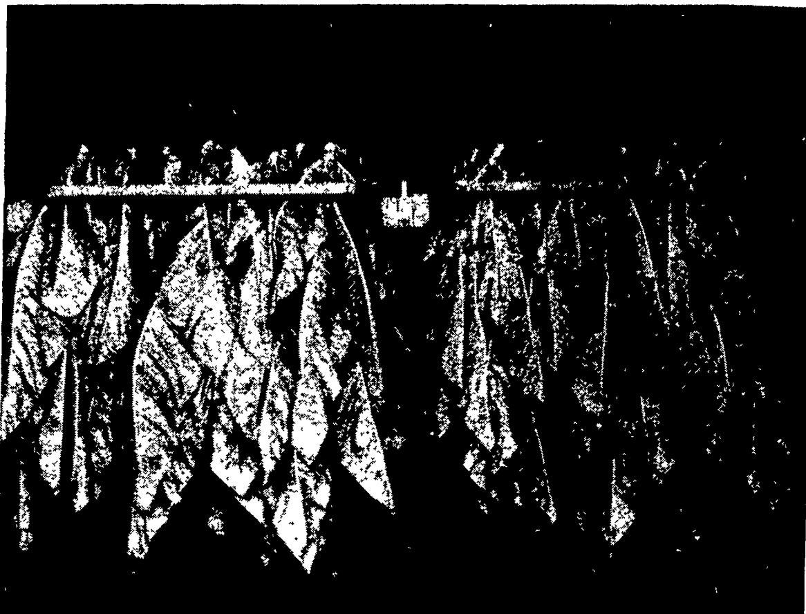
One of the busiest seasons of the year in Lancaster farming is at hand, as the heavy crop of tobacco moves from fields to sheds. Here is a view of a truckload at the entrance to barns on the new state tobacco experimental farm near Landisville.

Witmer also had three cows in this year's county 3000-pound fat club. They included Sue's Peerless Santa, with 107,151 pounds milk and 5177 pounds fat in 10 years, Meadow View's Agnes Gloria, 96,140 and 4572 in 9 years, and Meadow View's Red Blossom, 70,312 and 3237 in just over six years.