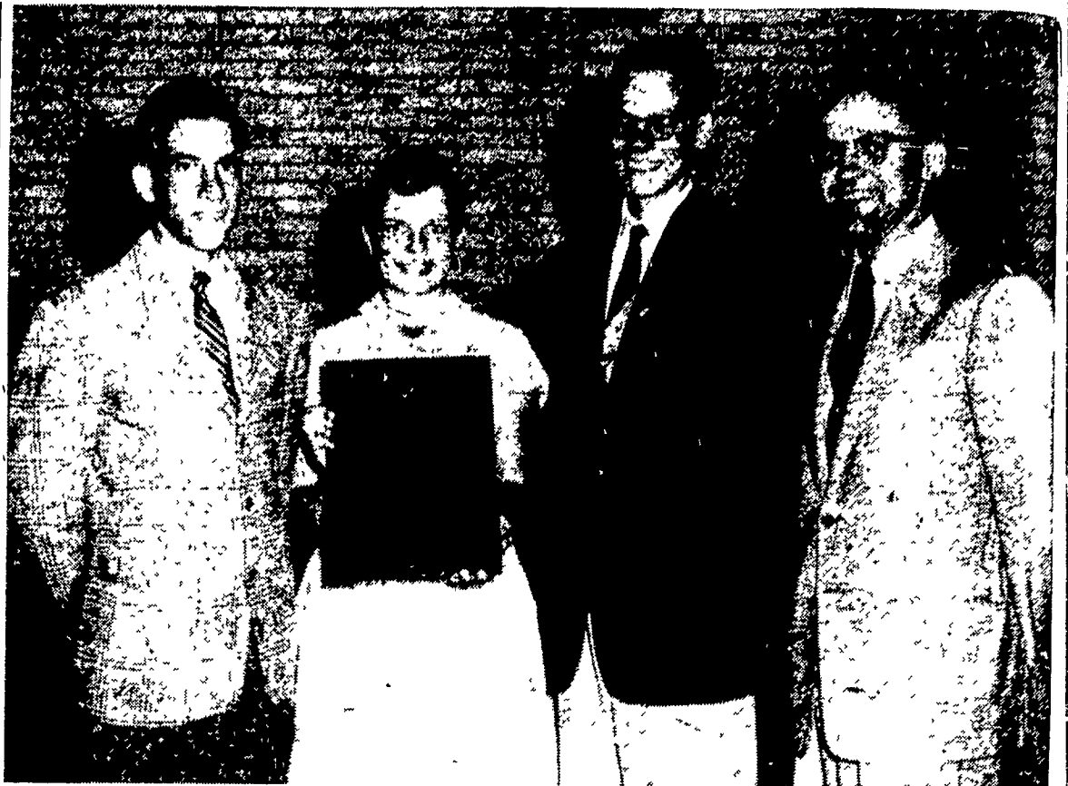
First-Place State Winner . . . 3coll18pt Lancaster County's Four-H Dairy Juug-ing Team which won first place during the 32nd annual 4-H Club Week at Pennsylvania State University Aug 13-16, 1956.

Here are Thursday, Aug. 16, 1956, sales, listed by lot number (each preceded by 16-), seller with grower indicated in parentheses, amount and breed, age by weeks and days, buyer and