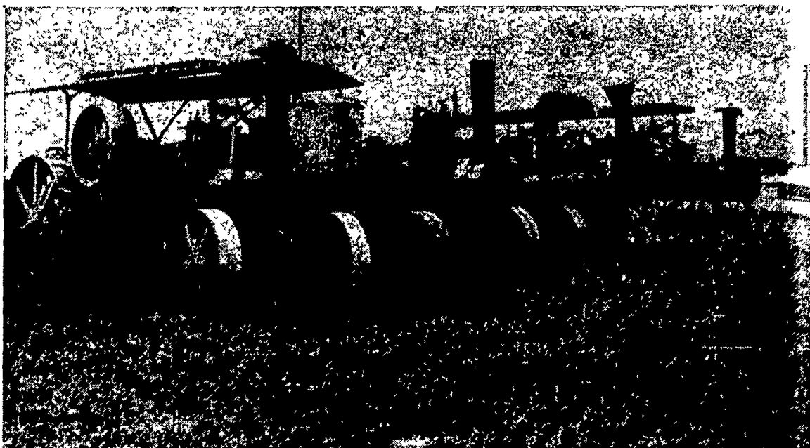
This weekend finds these steamers huffing and puffing as they did years ago at the eighth annual reunion of the Rough and Tumble Engineers Historical Association at Kinzers.