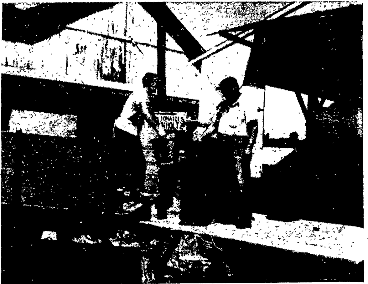
Tomatoes pour into receiving stations all over Southern Lancaster County. Here a truck is unloaded at the plant on the Park Eshelman farm near Rawlinsville.