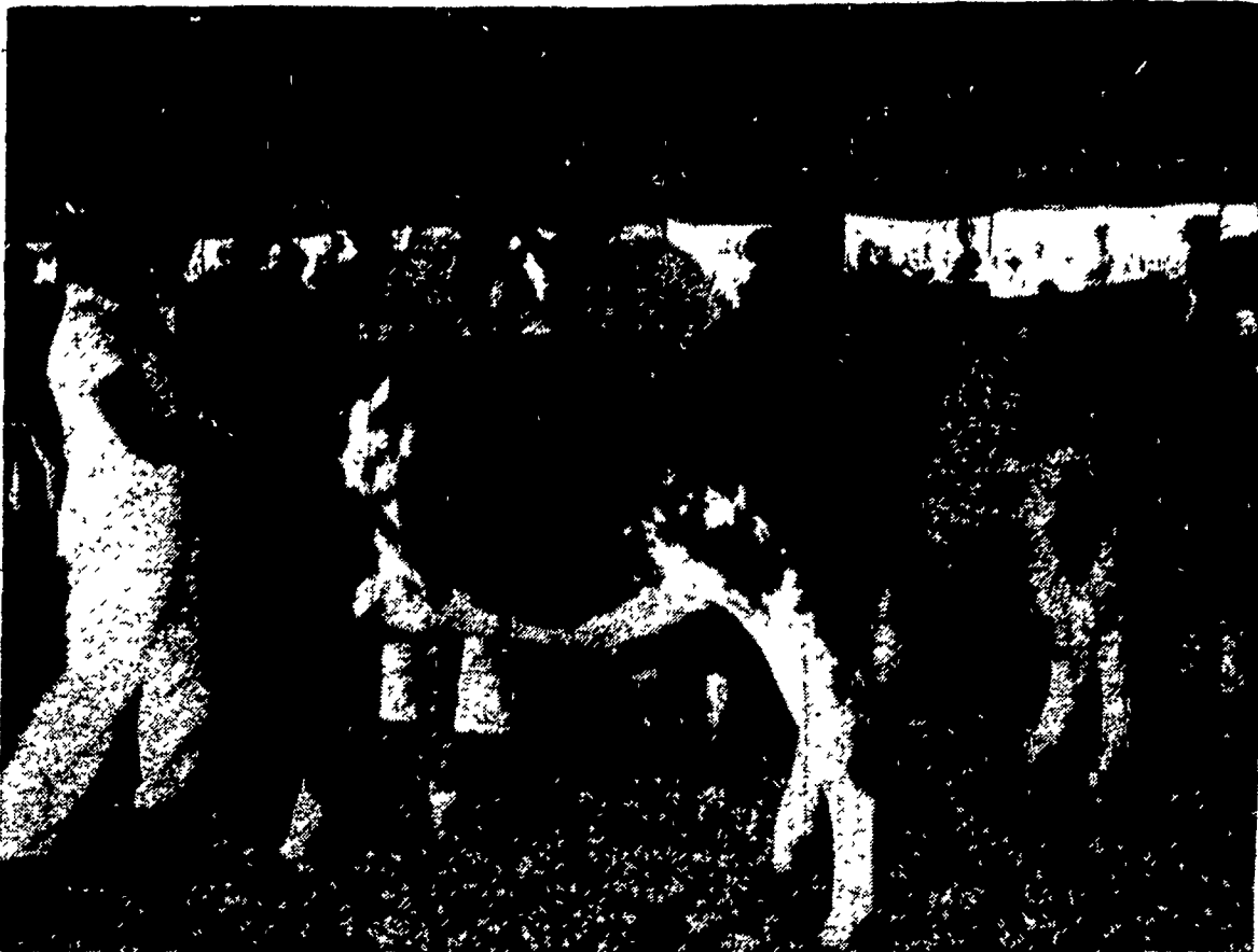
A youthful Lancaster County showman pushes and coaxes his charge into position during judging at the SPABC Dairy Cattle Show in Lancaster which brought out an excellent crowd last weekend.

Sept. 28-Oct. 6 — National Holstein Show, Waterloo, Iowa.