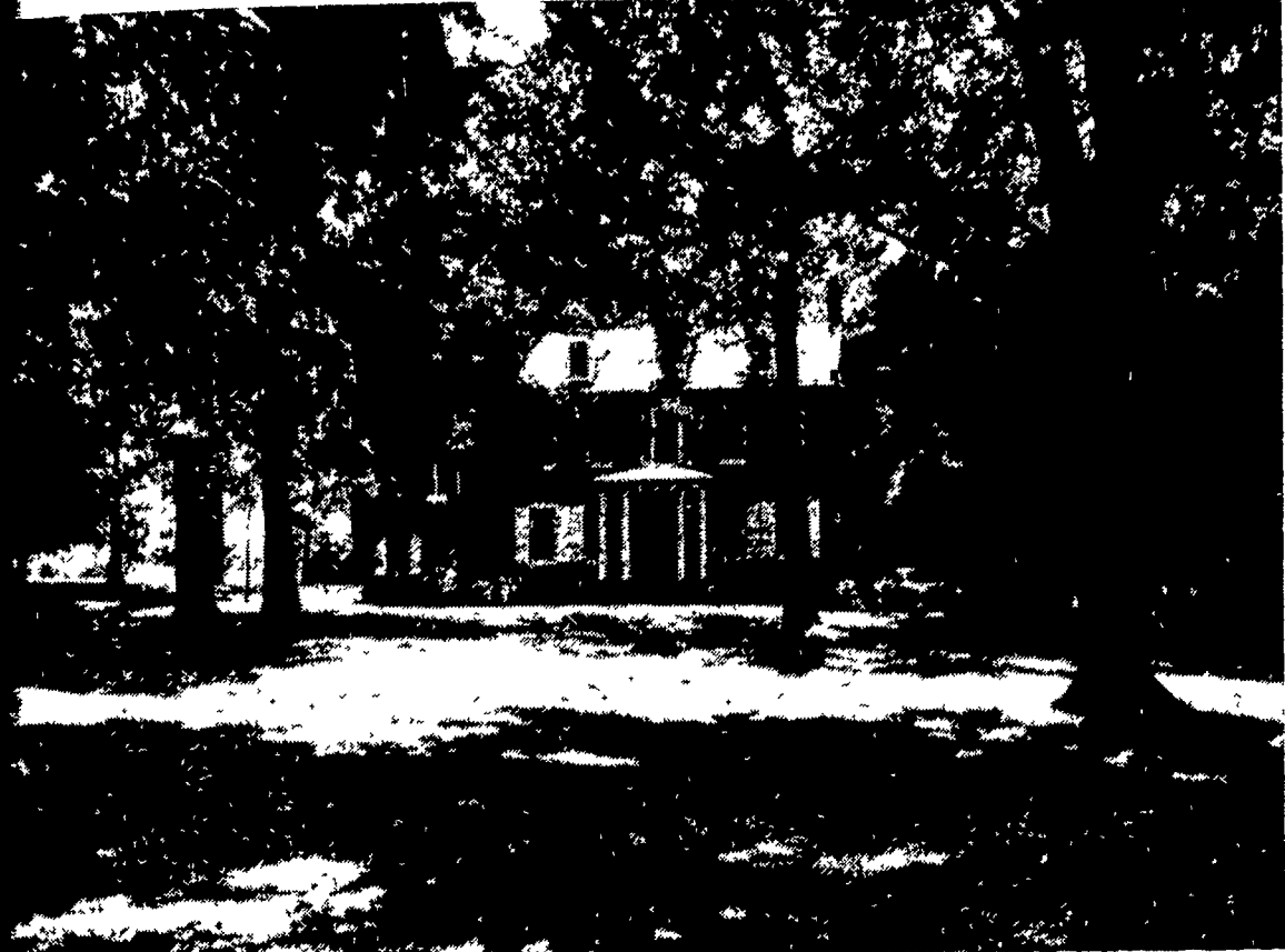
Thousands of tourists annually pay a visit to Wheatland, home of James Buchanan, first Pennsylvanian to become president of the United States. On Marietta Avenue it still retains the homey atmosphere that made this a popular gathering spot in years just prior to the Civil War.