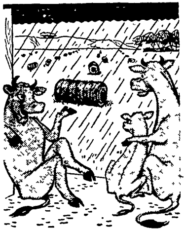
DON'T FRET, DEAR HAY KEEPS GREEN AND SOFT IN ROLLED BALES EVEN IF THEY ARE RAINED ON.

Let us show you why hay in rolled bales is winning blue ribbons for quality at leading shows. Your livestock needs the best.