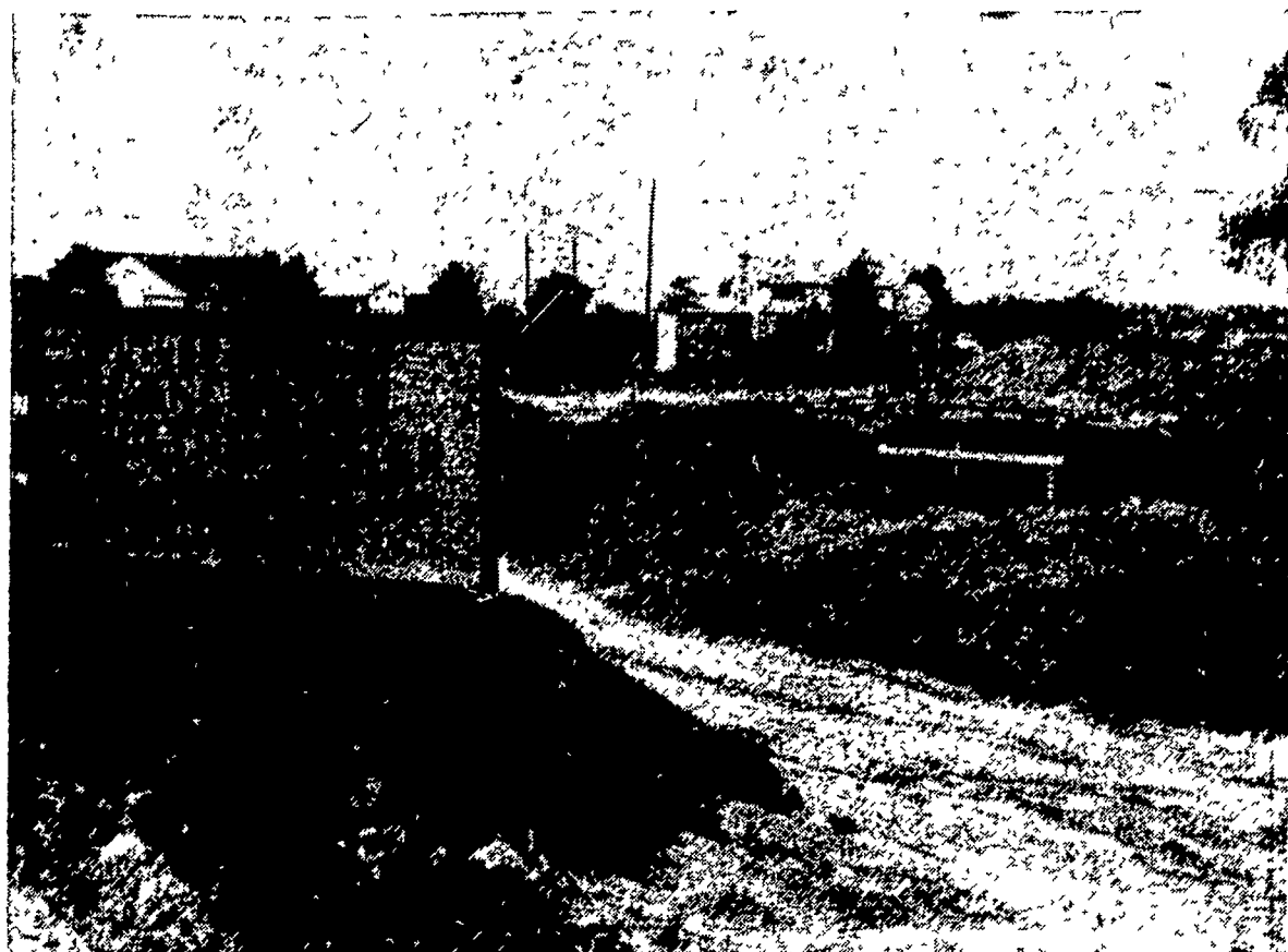
At the intersection of Bypass 230 and Roseville Road north of Lancaster, work is well underway at — as the sign indicates — the future home of Lancaster Poultry Center.