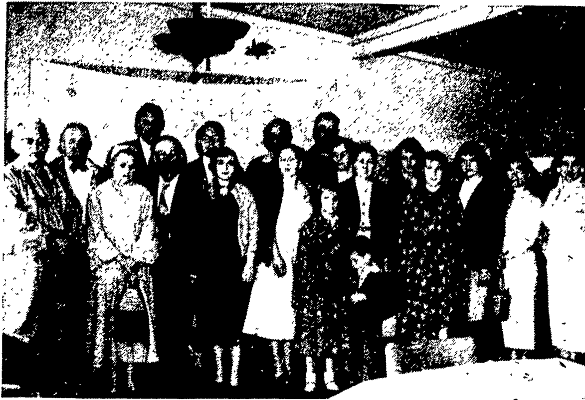
Nevertheless, more than 20 Pennsylvania Flying Farmers and their families gathered at the Berks County Airport in Reading Saturday to select new Queen.