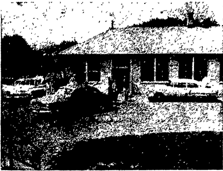
One of the unusual events of Graduation Week was a weekend trip for 13 senior agriculture students at Southern Lancaster Joint Community High School. Supervised by three faculty members, the group left in four cars Friday, returning Sunday. Here is a view of three of the cars being loaded, with the Quarryville vo-ag building in the background.