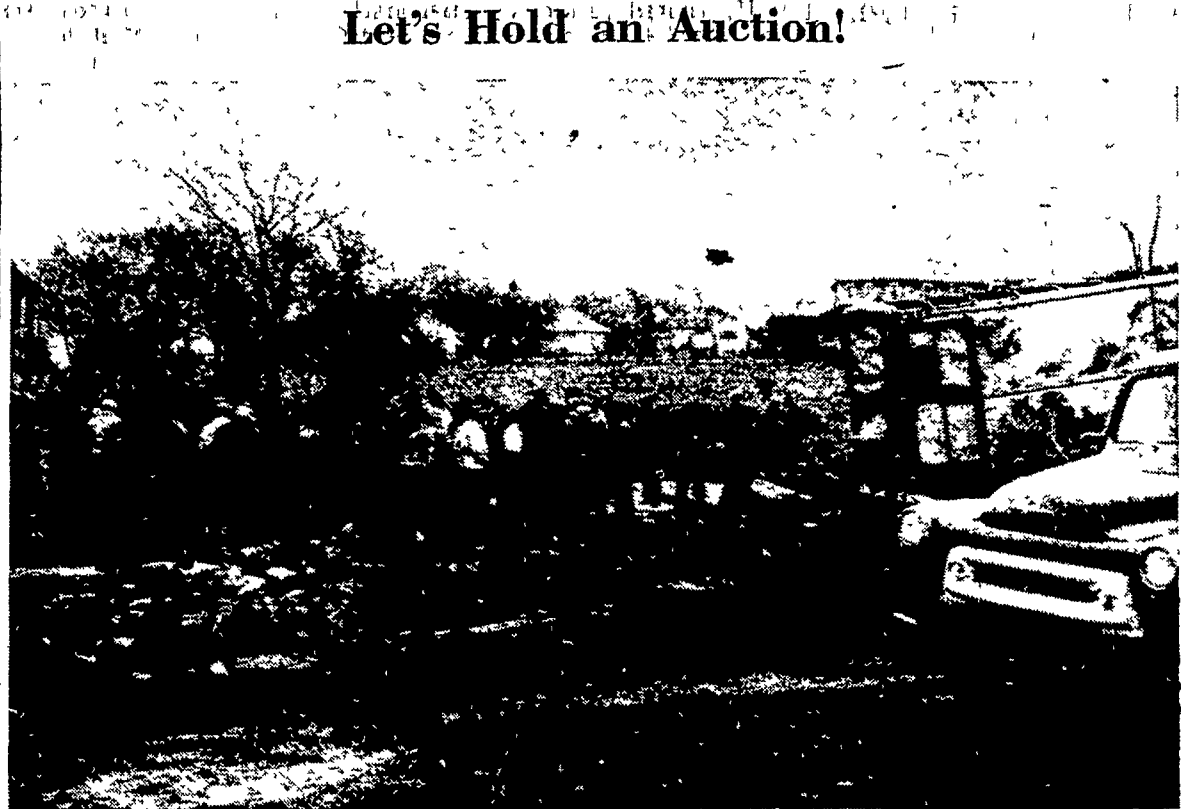
During the cleanup of ruins of the New Holland branch of the Lancaster County Farm Bureau, some one suggested, "Let's have a sale." Bidding was active for rolls of woven wire and other items that had a

There are six daughters of "Lucifer Star" presently in production in the Penn State herd