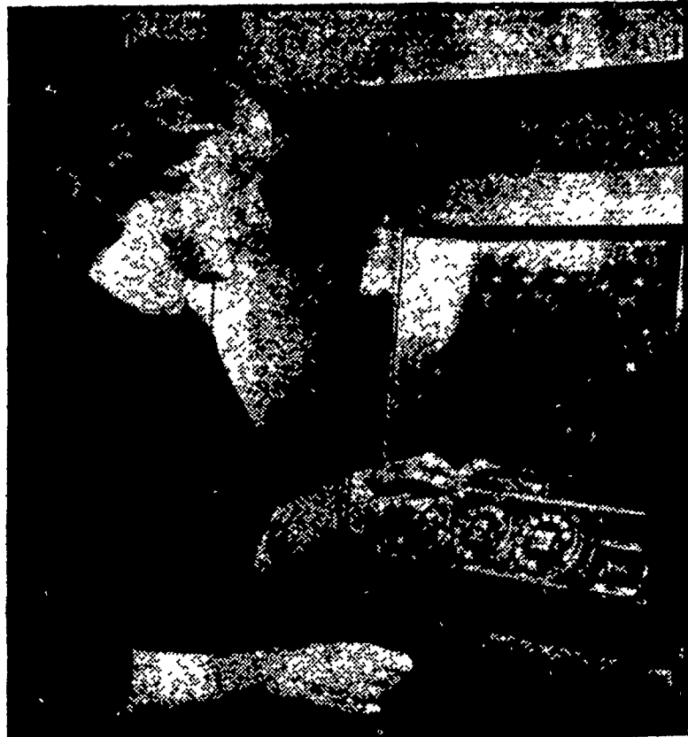
JUST LIKE OLD TIMES —Chit-chat of the general store post office makes a halfway comeback with installation of this stamp vending machine at the Federal Building Post Office in Detroit, Mich. When money is deposited, user dials number and denomination of stamps required. Out come the stamps and a polite, tape-recorded "thank you." Seasonal messages, such as "mail early for Christmas," may also be recorded from time to time as a reminder to customers.