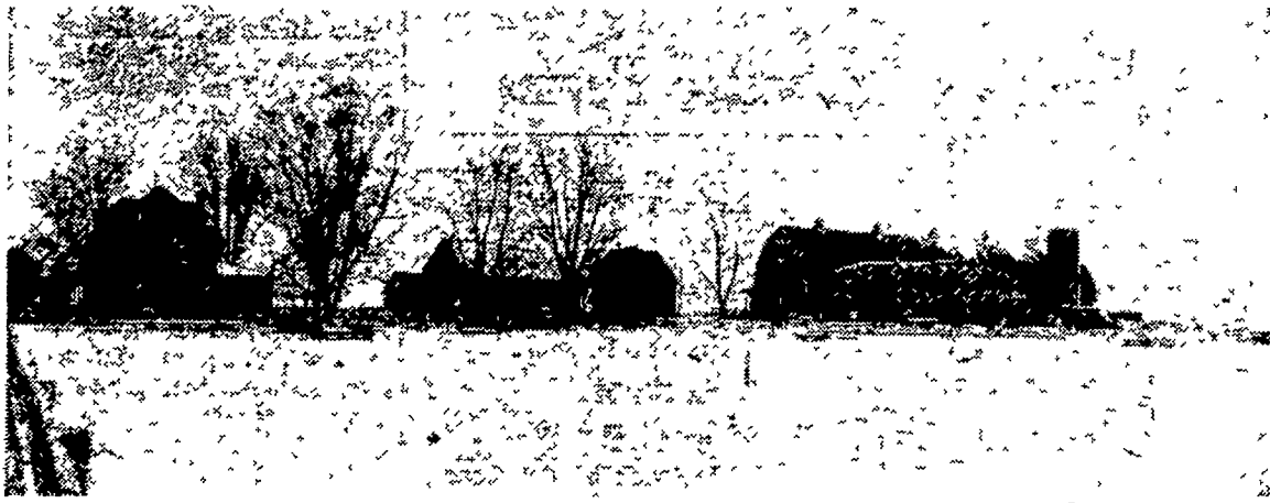
Here is a general view of Millarden Farms Angus operations Saturday, production sale day. On the extreme left is the manager's home, to the center and right barns, the show barn and sales arena. Cars are parked to the extreme right at this, one of the breed's outstanding sales in the east. (Lancaster Farming Photo).