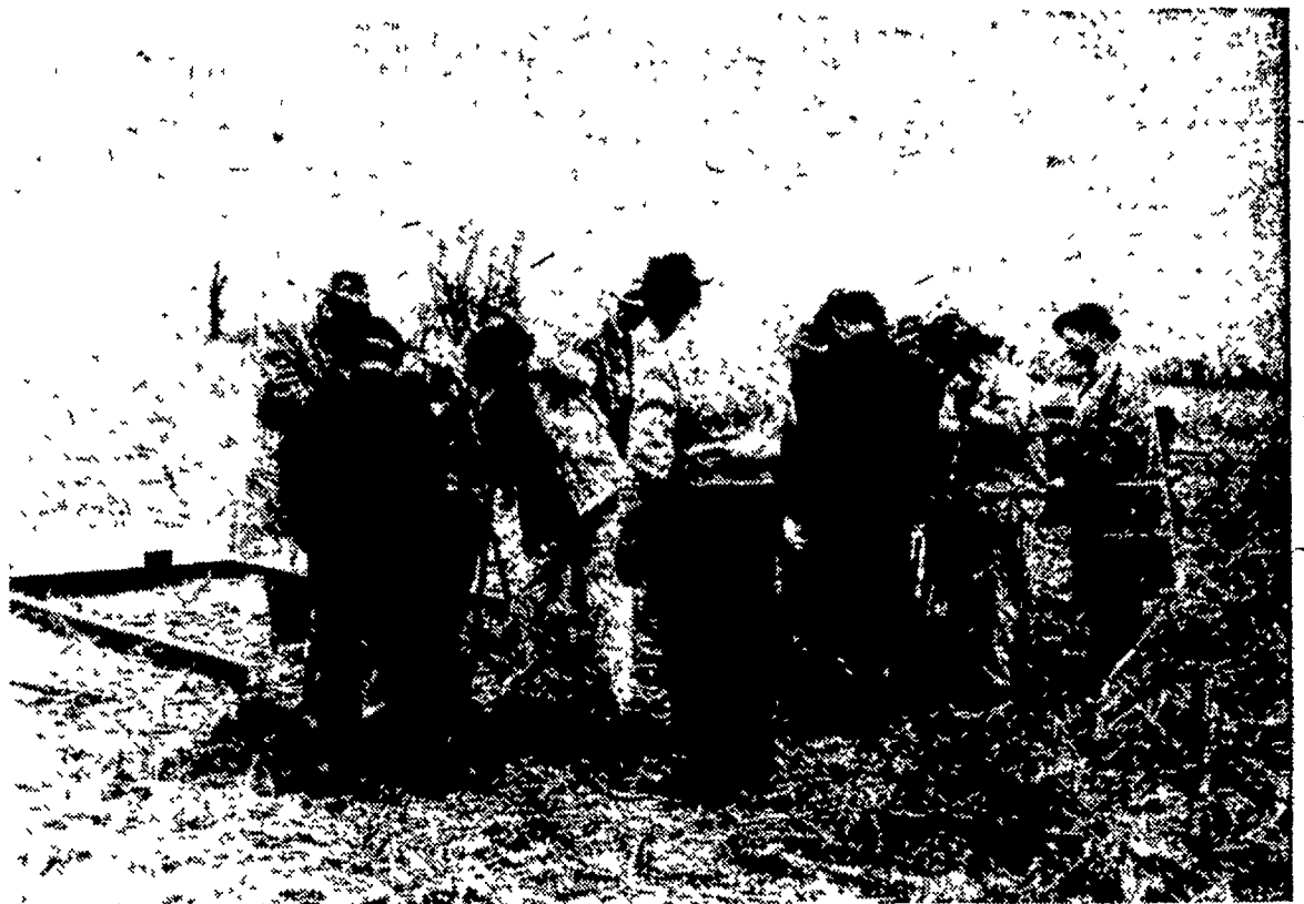
Here members of the Lancaster Poultry Exchange and the Lancaster Poultry Association man the shovels digging into the frozen earth to erect a sign proclaiming that some day soon there will be a Lancaster Poultry Center northwest of Lancaster. Brief ceremonies Saturday morning launched the project.

ter Poultry Center northwest of Lancaster. Brief ceremonies Saturday morning launched the project.